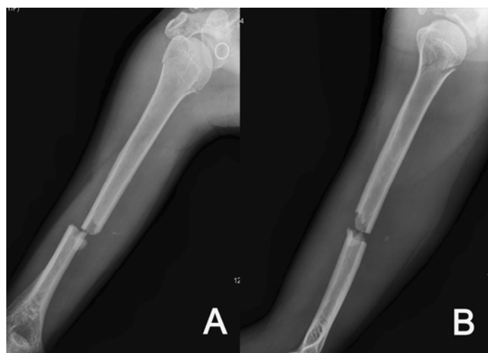
Fig. 1 – 47 year-old lady (case No 6) sustained multiple rib fractures and fractures of the right upper extremity. Proximal humeral neck fracture, initially not recognized, was identified. Non-displaced two-part surgical neck fracture, Müller AO Classification A2 (impacted metaphyseal fracture) was diagnosed for humeral neck fracture intraoperatively. Shaft fracture was classified as simple transverse fracture (AO Classification A31).

The deltopectoral approach was used for surgical neck fracture and the anterolateral Henry approach, splitting brachialis was used for shaft fracture fixation. One patient was treated with a T-shape dynamic compression plate for surgical neck fracture and the other one with a proximal humeral locking compression plate. The conventional 4.5 mm AO/ASIF limited contact dynamic compression plate (Synthes, Paloli, PA) was used for shaft fractures (Figure 2).