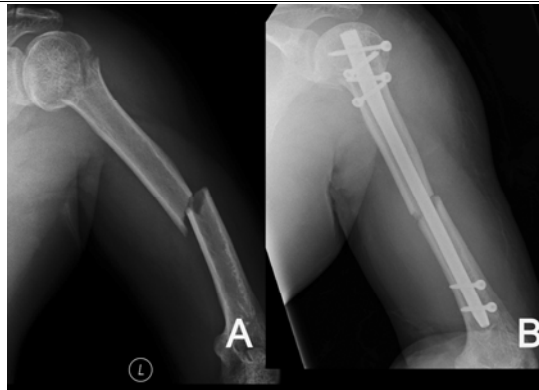
Fig. 3 –A 40-year-old man (case No. 5) sustained fracture after road traffic accident: A) Plain radiographs showed ipsilateral humeral neck and shaft fractures; B) The patient was treated with antegrade intramedullary nail Polaris (Acumed, Beaverton, OR) and postoperative radiographs presented 3 mm gap between the fracture fragments. The patient developed shaft nonunion which required autogenous bone graft.

ral shaft fixation, they were identified and diagnosed with AO type A2 (impacted metaphyseal fracture).